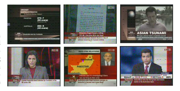
Figure 3: Top 6 Results on English Videos for the query "Australia"

For the Telugu and Hindi results, we show here the results for the queries "Adhyakshudu" and "Sania" respectively. Here also, one can observe independence of font styles and sizes. For the query "Sania", a result containing "Sonia" has been returned. Since the database has only five instances of "Sania" the nearest matching "Sonia" is returned. This may be attributed to the fact that "Sania" and "Sonia" differ only in their upper pro-