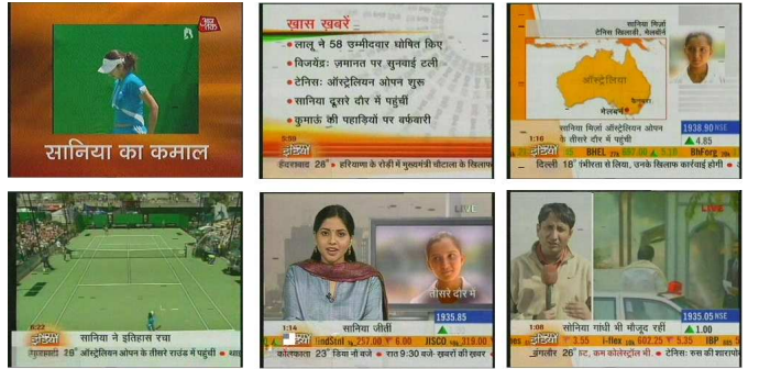
Figure 5: Top 6 Results on Hindi Videos for the query "Sania"