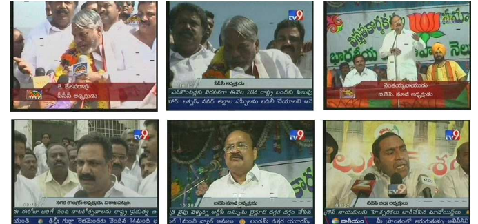
Figure 7: Top 6 Results on Telugu Videos for the query "Adhyakshudu"