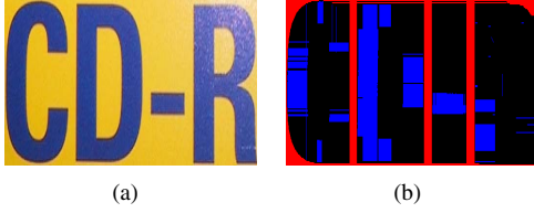
Figure 2. (a) Input Image (b) Its foreground-background seeds, Red and blue colour shows foreground and background seeds respectively (Best viewed in colour).