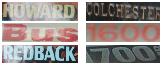
Figure 1. Some samples images we considered in this work

We, in this work, focus on binarization of natural scene text. Natural scene texts contain numerous degradations not usually present in machine printed ones such as uneven lighting, blur, complex background, perspective distortion, multiple colours etc. Methods such as interactive graph cut by Boykov et al. [2] and thereafter GrabCut [3] have shown promising performance in foreground/background segmentation of natural scenes in recent years. We formulate